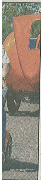
mini-1940 ed drag car (S-Overland

out the engine of his 1957 T-bird, one of the show cars at the Hartnett Park on Sunday.